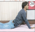
Hamstring Stretch Adductor Stretch Iliopsoas Stretch