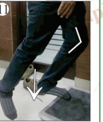
Alfredson's Protocol (Rep..... Set .....