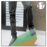
Proprioception & Balance Ex