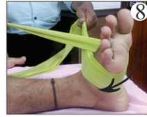
Resisted Exercise (Rep..... Set .....