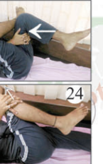
IT Band/ TFL Stretch Rectus Femoris Stretch Piriformis Stretch