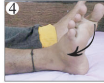
ROM Exercise (Rep..... Set .....