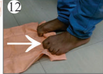
Toe curl (Rep.....)