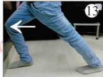
Calf Stretch (Rep..... Hold .....